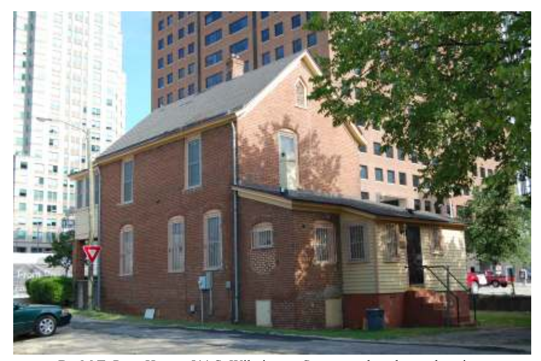
Dr. M.T. Pope House, 511 S. Wilmington Street, south and rear elevations