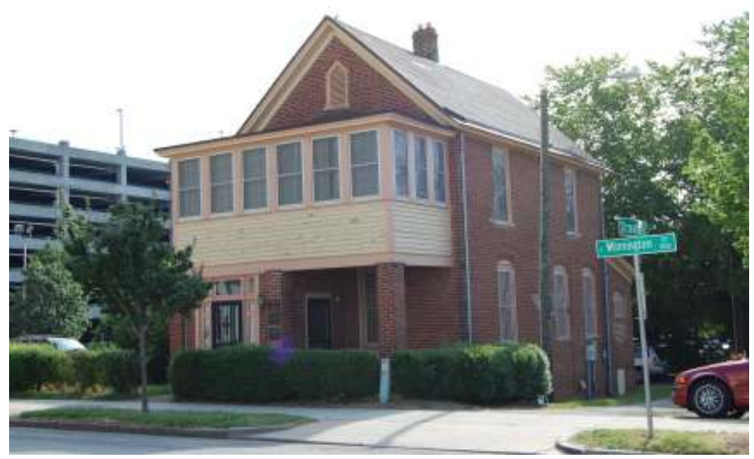
Dr. M.T. Pope House, 511 S. Wilmington Street, facade