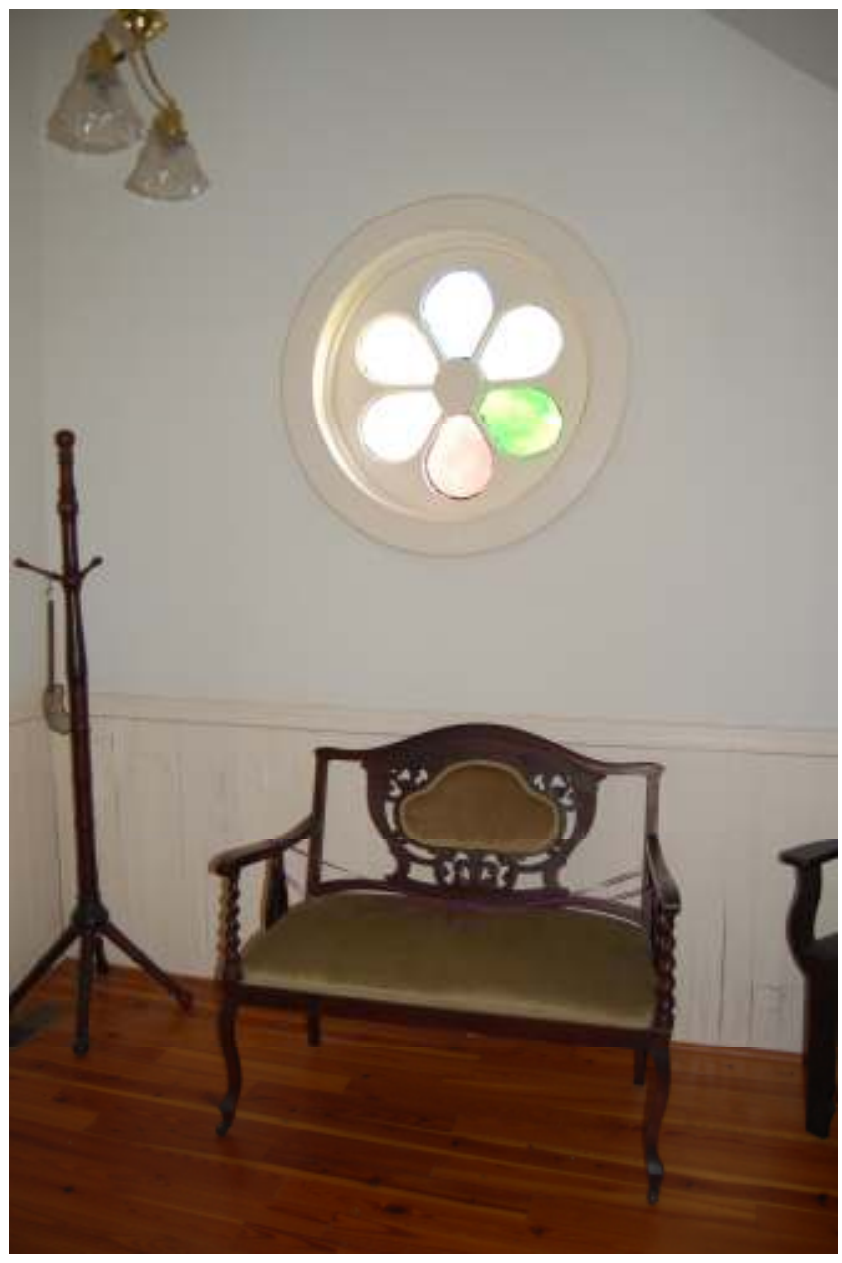
Dr. M.T. Pope House, 511 S. Wilmington Street, Interior showing front entryway and original furniture